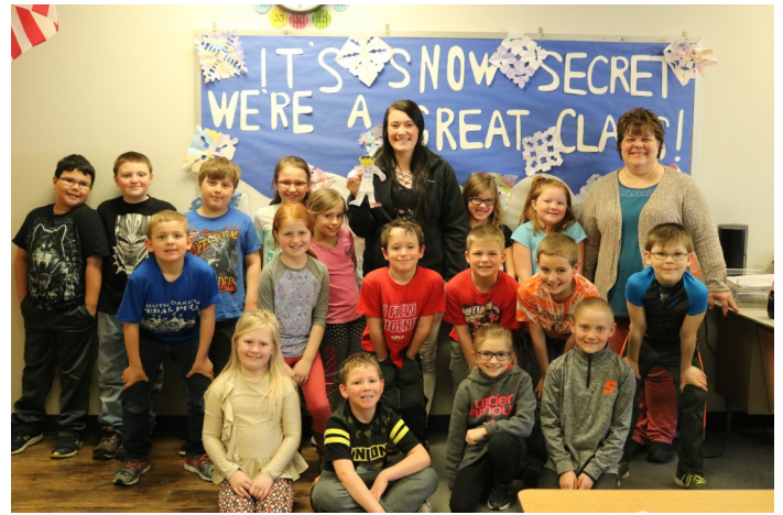
FLAT STANLEY from Mitchell, SD came to visit the 2nd Grade Classroom during the Month of March.